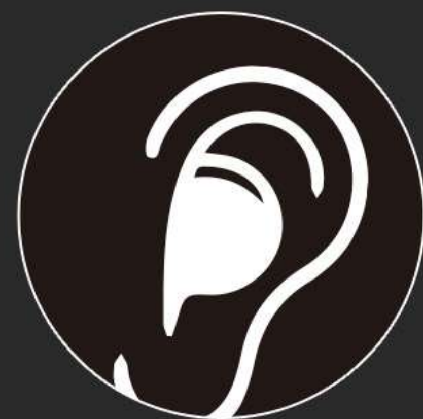
EARPLUG 50 YEN