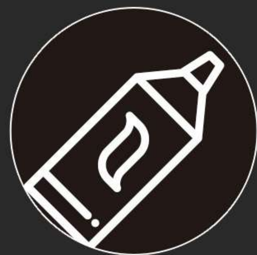
TOOTHPASTE 100 YEN