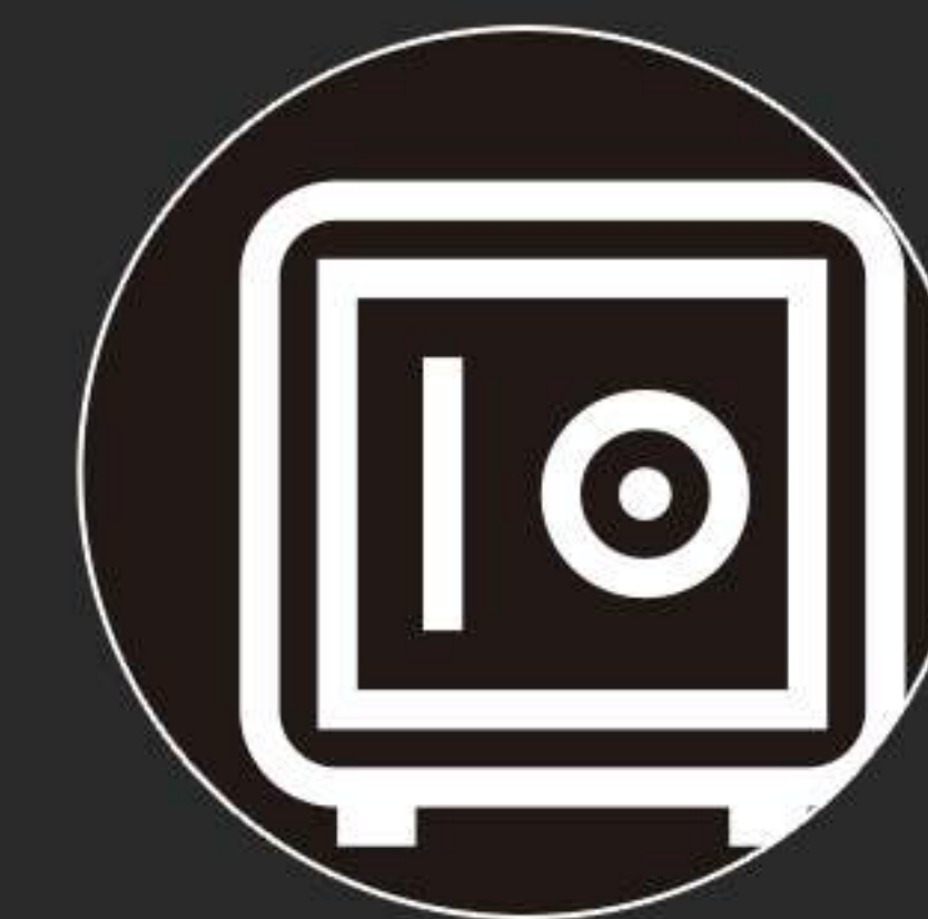
SAFE BOX 500 YEN