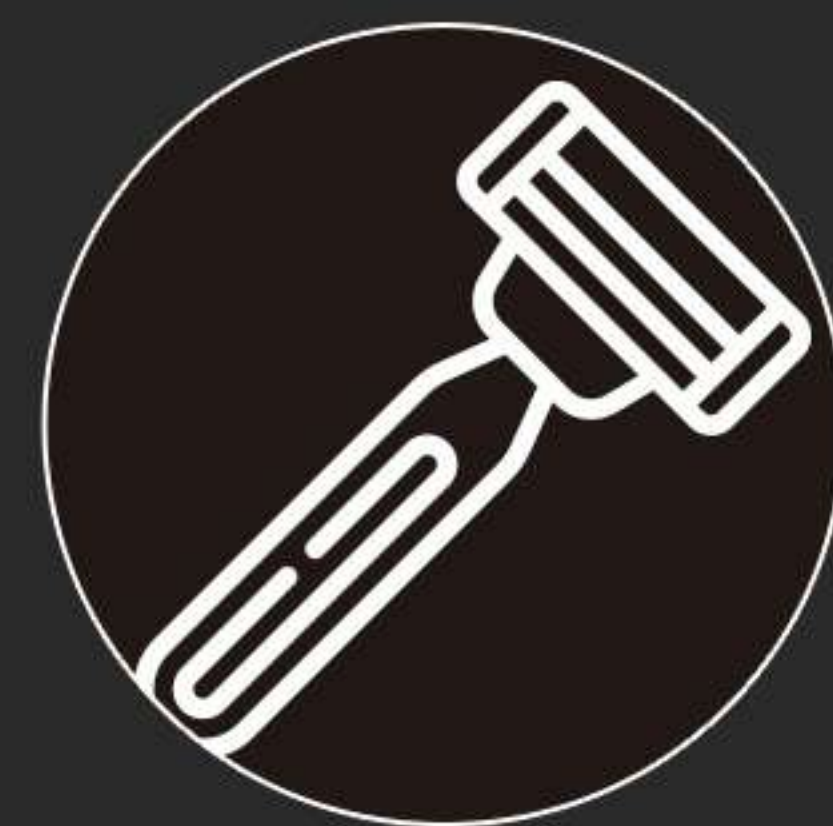
RAZOR 100 YEN