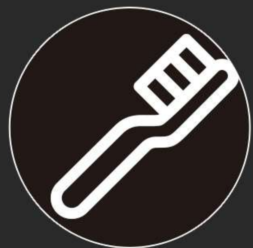
TOOTH-BRUSH 100 YEN