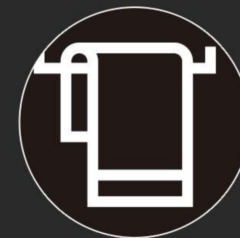
TOWEL 100 YEN